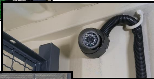
4 – 16 motion sensing cameras