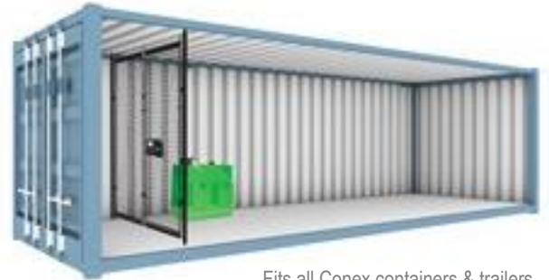
Fits all Conex containers & trailers