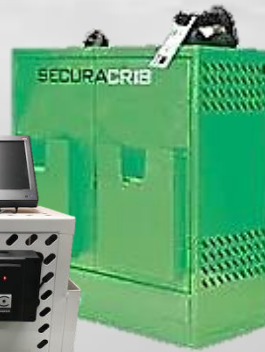
SecuraCrib & SecuraPort

High Tech Affordable & Portable Inventory Management