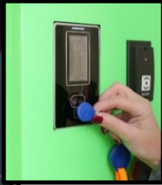
Authorized user is granted access to container via controlled access system